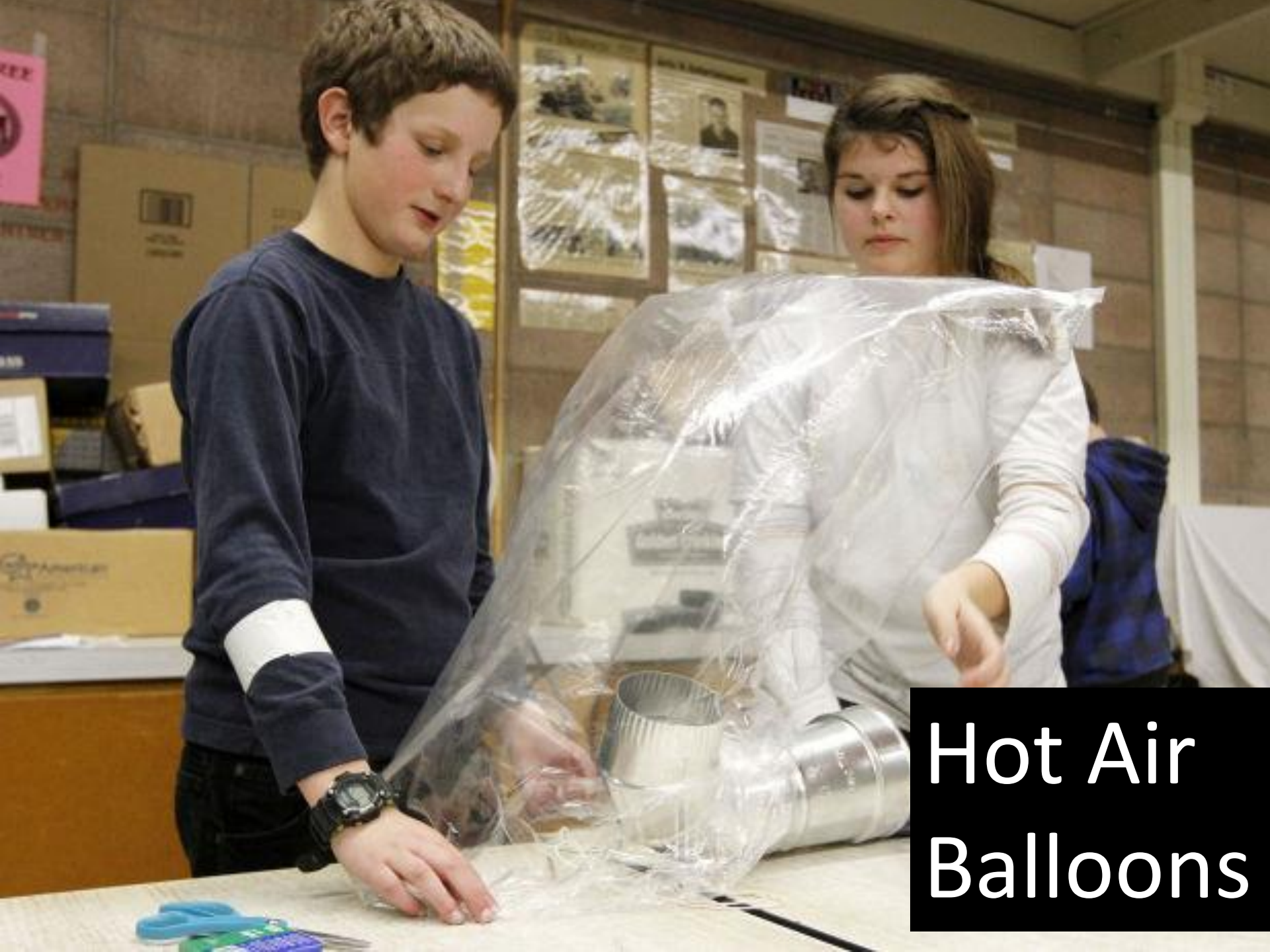
Hot Air Balloons