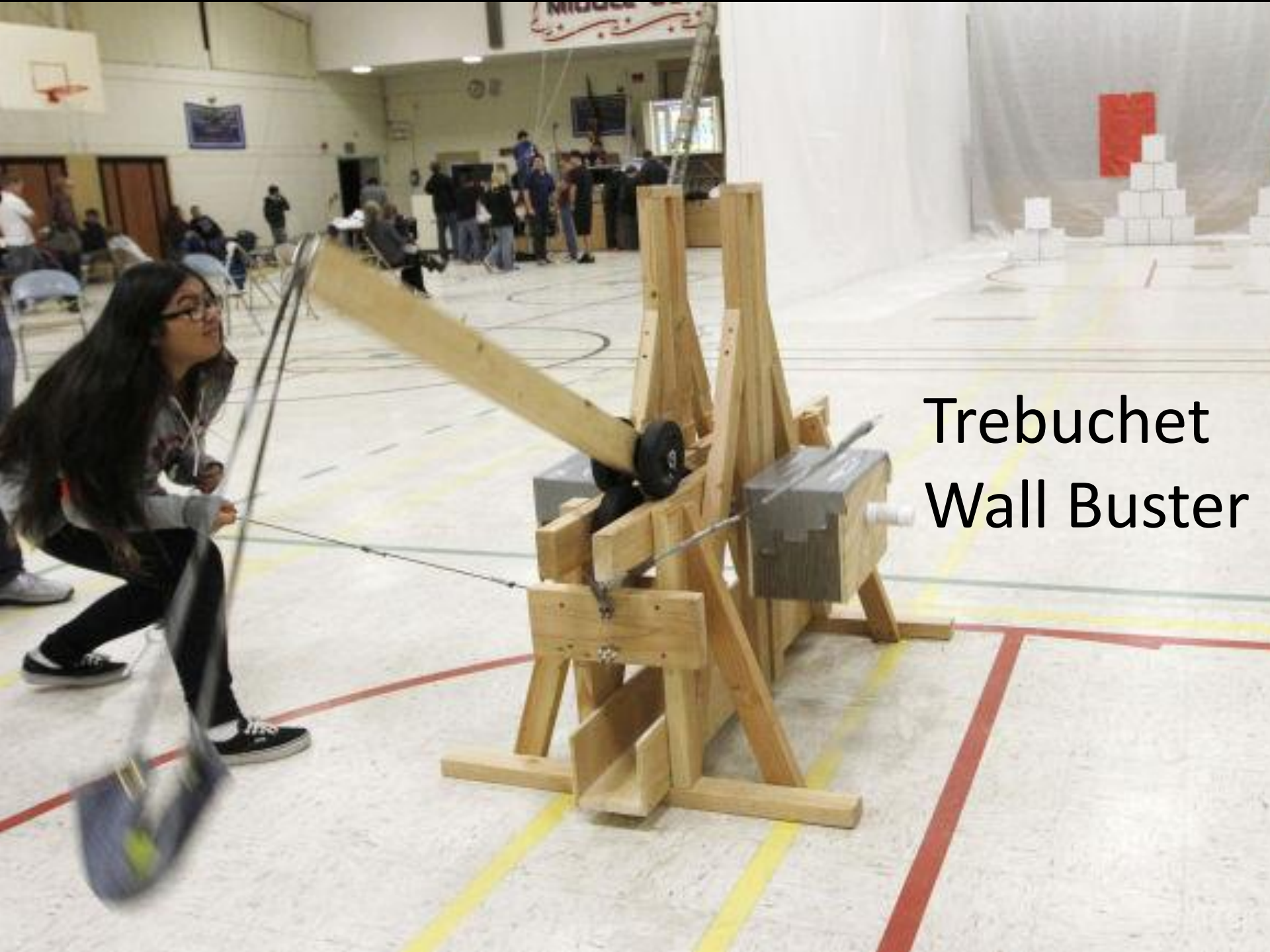
Trebuchet Wall Buster